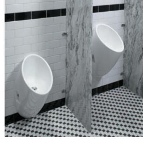
Steward<sub>o</sub> S Waterless urinal K-4917-0

Farmington <sub>®</sub> Self-rimming lavatory K-2905-1-0