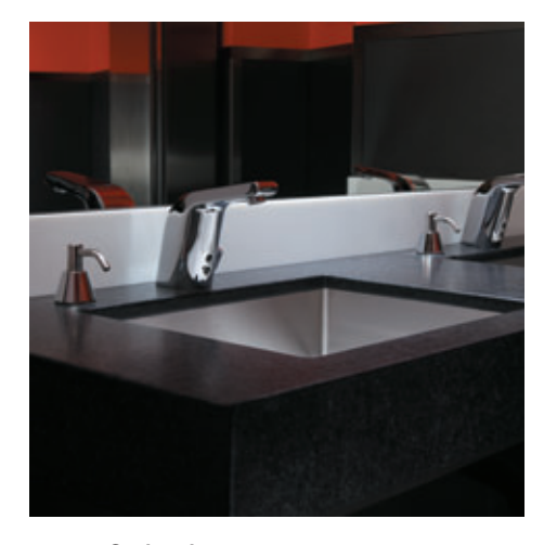
Insight<sub>•</sub> Sculpted Touchless lavatory faucet with Insight<sub>•</sub> technology K-13460-CP